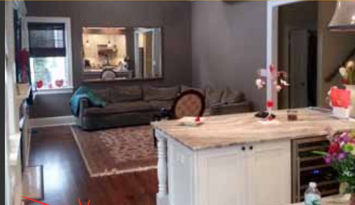
Our team removed walls during this renovation to create an open concept living space.

For faucets, lighting and hardware, we're seeing brushed gold finishes, such as satin brass or satin gold, growing rapidly in popularity. Pairing either of these finishes with navy, one of this year's most popular colors, in the bathroom works extremely well! For those who can't part with stainless steel, incorporating polished nickel by way of hardware and faucets can add a beautiful contrast.