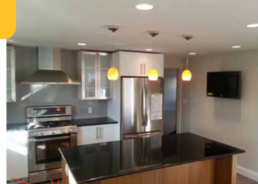
We installed two-toned cabinets and a black countertop for this trend-setting kitchen reno.